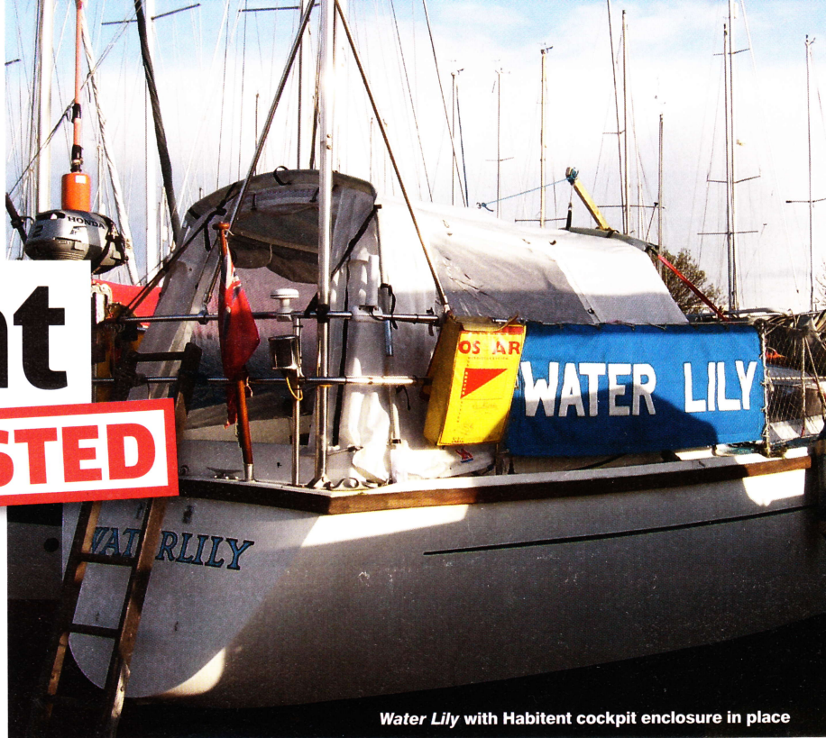
Water Lily with Habitent cockpit enclosure in place

T he first winter we spent living aboard our Cobra 850 Water Lily represented a steep learning curve. Top of our 'lessons learned' list was the need for an effective cockpit cover. I'd experimented in the boatyard with a tarpaulin that was fine for access via the stern, but which wasn't going to suit access amidships from a finger pontoon. After attempting to build a cheap and robust shelter without success, I was giving up hope of spending anything under the £1,000 quoted for a cockpit cover.