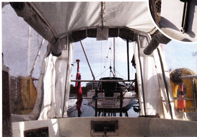
There's enough headroom to remove wet weather gear in the cockpit