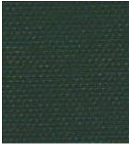
488 Forest Green