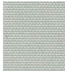
489 Silver Gray