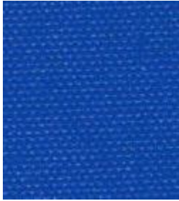
494 Caribbean Blue