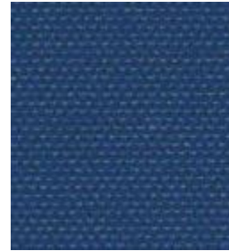
498 Harbor Blue